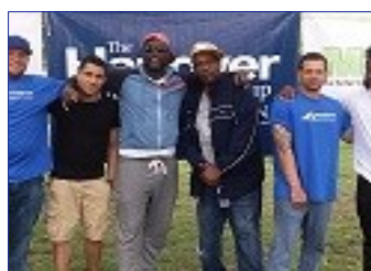
Walk for Hunger