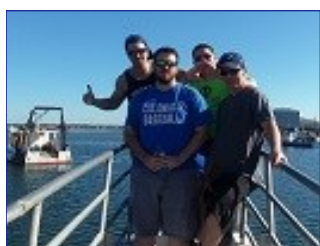
Deep sea Fishing

Looking for more information about the volunteer programs we have to offer? Contact Alyssa at 508.755.6403x10 or via email alyssa@Jeremiahsinn.com