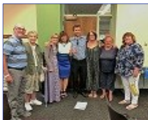
Annual Meeting 2018