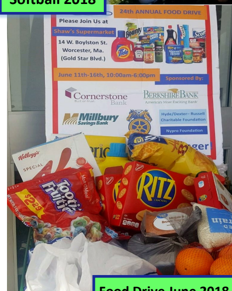
Food Drive June 2018